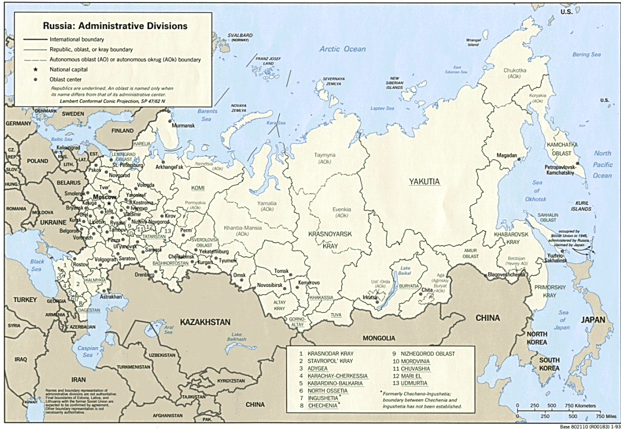
Figure 8. “Russia: Administrative Divisions.”

Russia: Administrative Divisions [map]. Scale not given. Perry-Castañeda Library Map Collection – University of Texas < http://www.lib.utexas.edu/maps/commonwealth/russia.gif > (25 October 2014). (public domain)