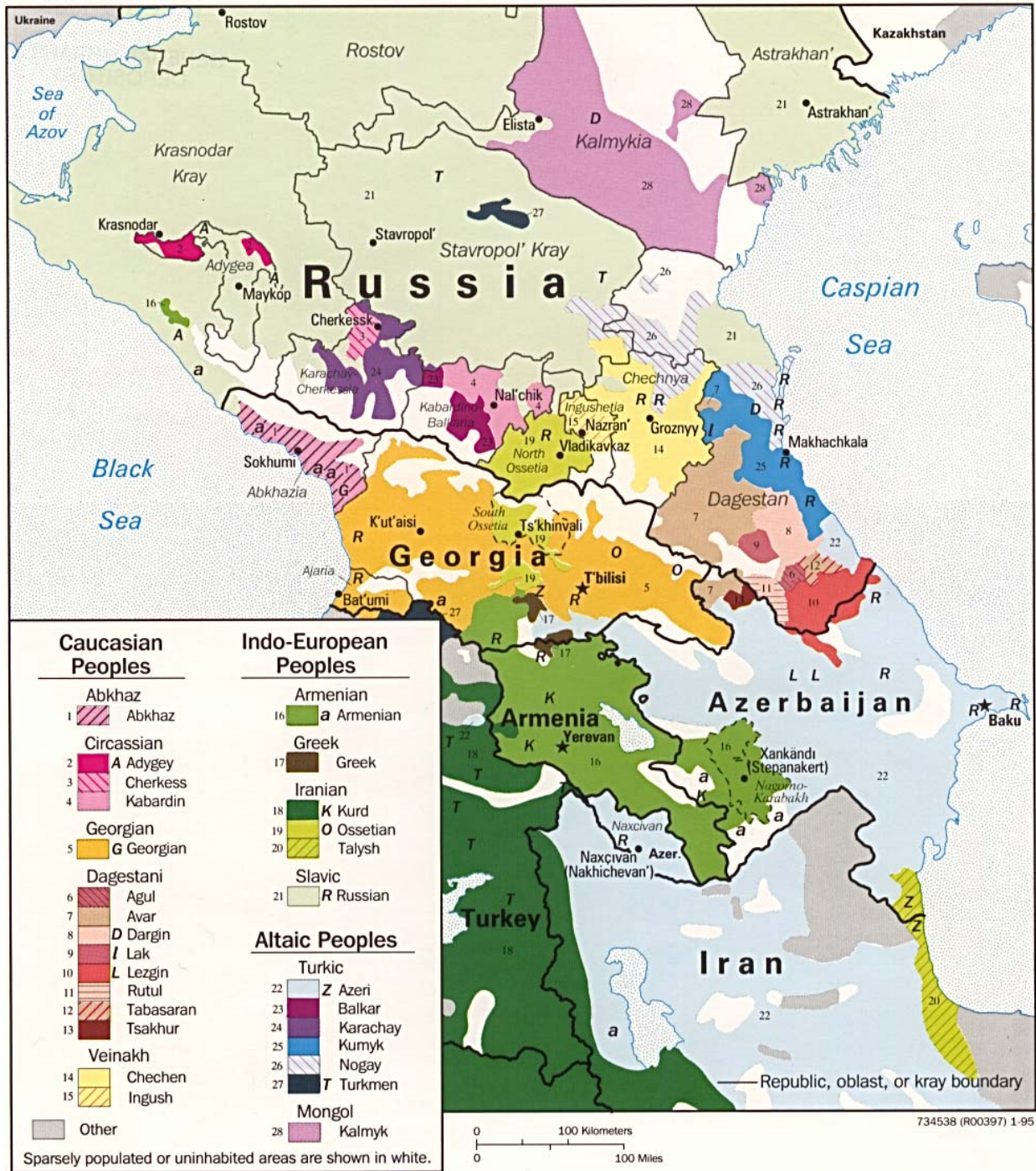
Figure 1. “Ethnolinguistic Groups in the Caucasus Region.”

Ethnolinguistic Groups in the Caucasus Region [map]. Scale not given. Perry-Castañeda Library Map Collection – University of Texas