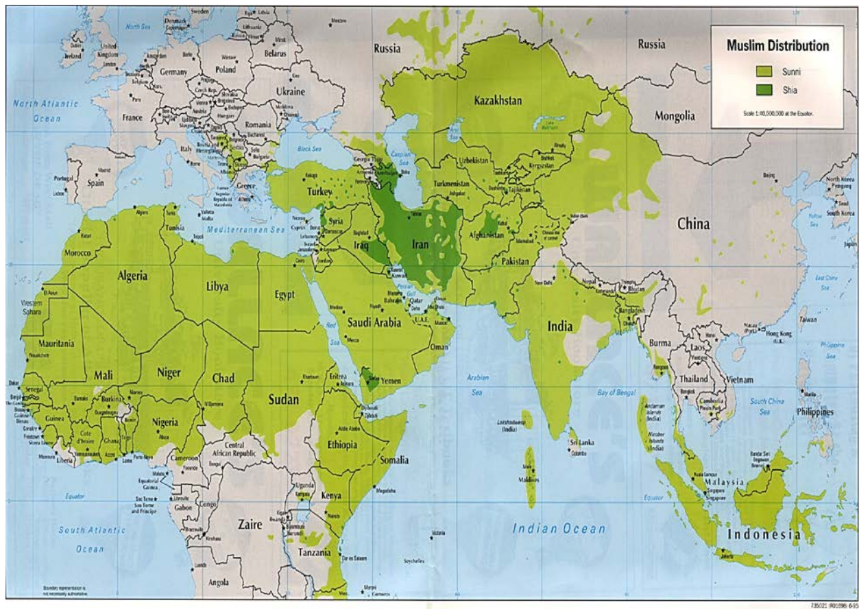
Figure 4. “Muslim Distribution.”

Muslim Distribution [map]. 1: 40,000,000. Perry-Castañeda Library Map Collection – University of Texas < http://www.lib.utexas.edu/maps/world_maps/muslim_distribution.jpg > (25 October 2014). (public domain)