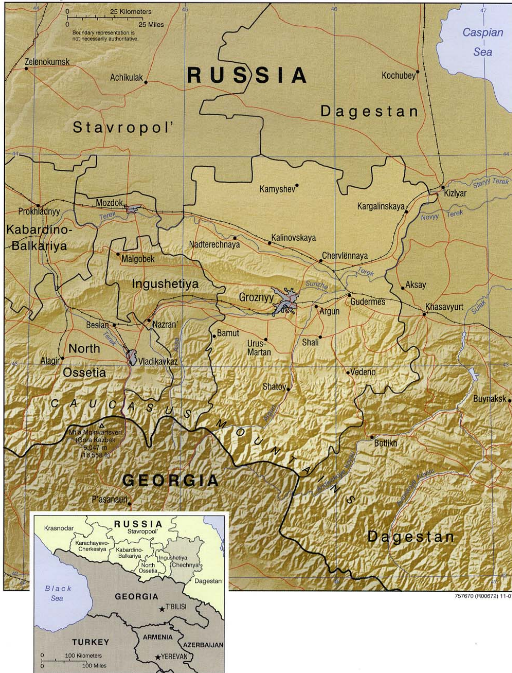
Figure 5. “Chechnya, 2001.”

Chechnya [map]. 2001. Scale not given. Perry-Castañeda Library Map Collection – University of Texas < http://www.lib.utexas.edu/maps/commonwealth/chechnya_re101.jpg > (25 October 2014). (public domain)