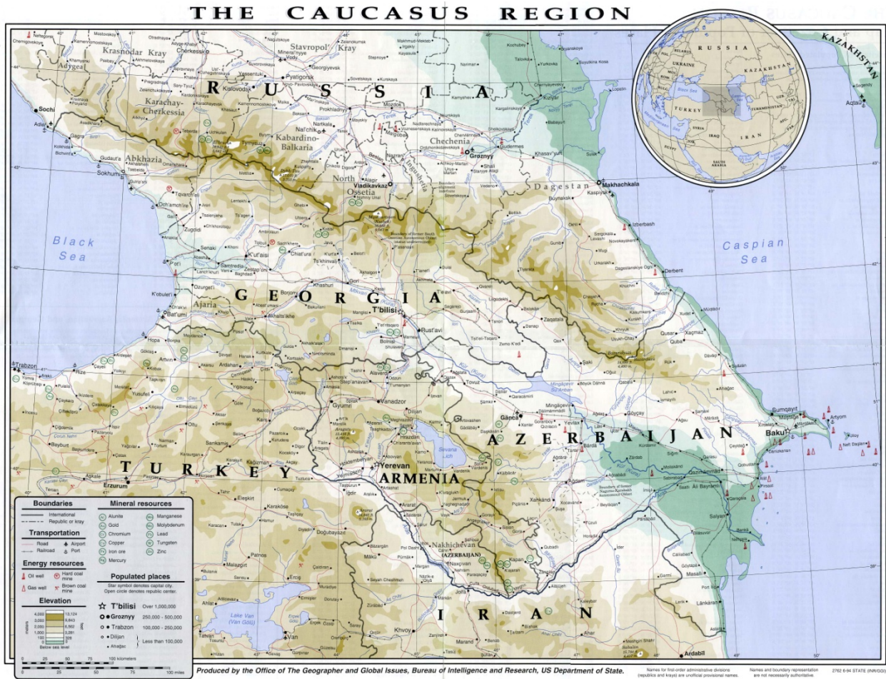
Figure 2. “The Caucasus Region, 1994.”

The Caucasus Region [map]. 1994. Scale not given. Produced by the Office of the Geographer and Global Issues, Bureau of Intelligence and Research, US Department of State. Perry-Castañeda Library Map Collection – University of Texas